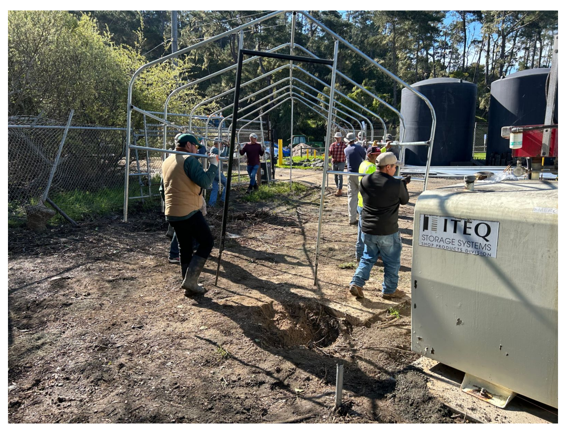
See a short video flood and read more about the damage here: FFRP News and this article in New Times SLO.

disassemble and move the nursery was the same one that helped build it only a few months ago.